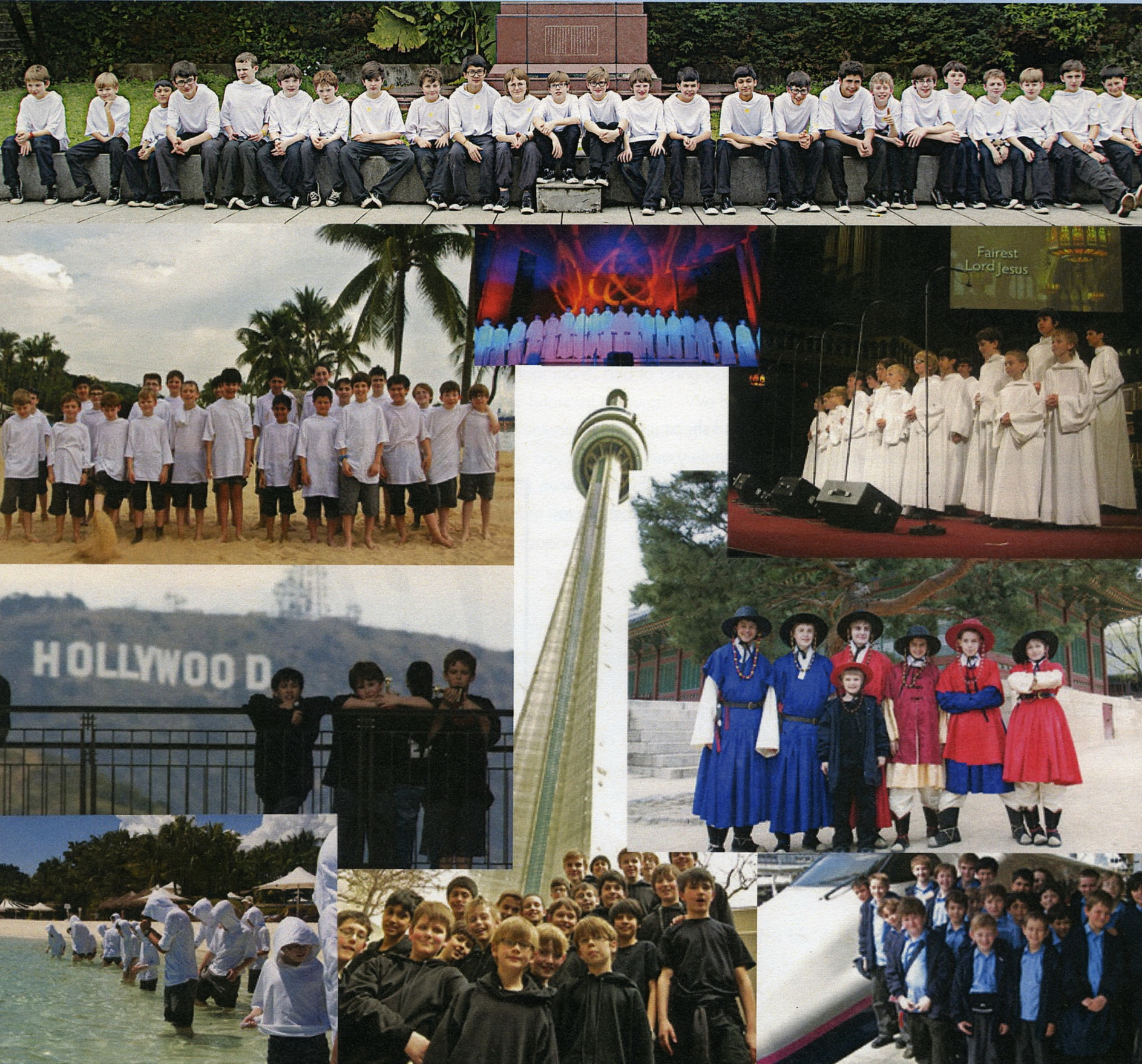
Top photo | Yangmingshan National Park, Taiwan Clockwise from left to right | Sentosa Island, Singapore | Clifton Cathedral, England | Moody Church, Chicago, USA Gyeongbokgung Palace, Seoul, South Korea | Tokyo, Japan | CN Tower, Toronto, Canada Cebu, Philippines | Hollywood, Los Angeles, USA