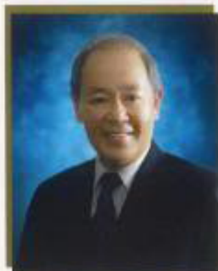
Dr. Roberto F. de Ocampo Former Secretary of Finance and Chairman, British Alumni Association

I was hooked and listened to the whole CD enthralled. The sound of LIBERA was not just ethereal, it was mood changing as it embodied peaceful feelings and seemed to transport one to another calmer, gentler place. Since that time, I endeavored to invite LIBERA to the Philippines not only to introduce their music here and share my experience of their music