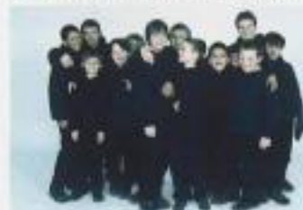
Boys song "Love and Mercy", that harked back to Wilson's early musical life as a choirboy.

The group is well known to British audiences through TV appearances and staged concerts at venues as diverse as the Queen Elizabeth Hall in London, the Grassington Festival, Abbey Road Studios and Arundel Cathedral. Libera has made many TV appearances including BBC-TV's 'Last Choir Standing', on which the Libera boys were featured as guests. They were winners of the Saturday night show 'When Will I Be Famous' and recently had a whole documentary devoted to them on BBC-TV's 'Songs of Praise'. In the run up to Christmas, the boys were heard singing the music for the distinctive Waitrose TV campaign. Libera regularly sing at events and services in cathedrals and churches like Buckfast Abbey and Westminster Cathedral.